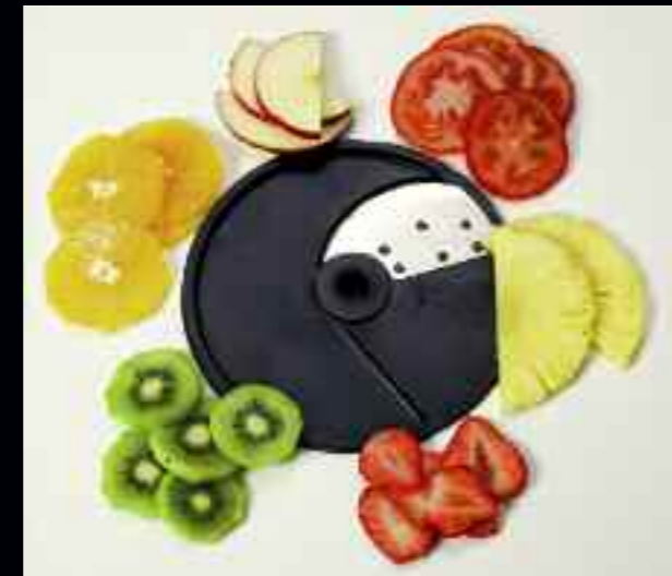
Tomato slicer (TO)