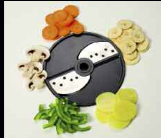
Coarse cut (G)