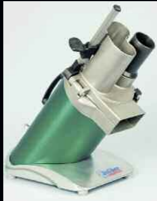
anliker Multicut 240: Processes up to 500 kg per hour. Ideal for caterers, food manufacturers and other large-scale processors.