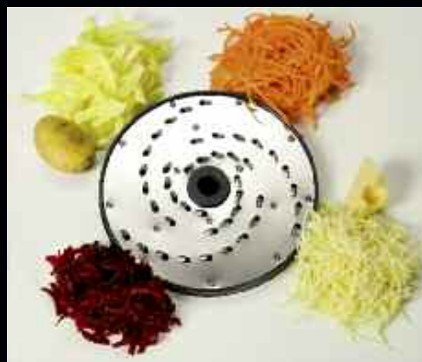
Shredding disc (RS)