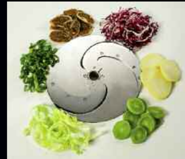
Sickle blade (SM)