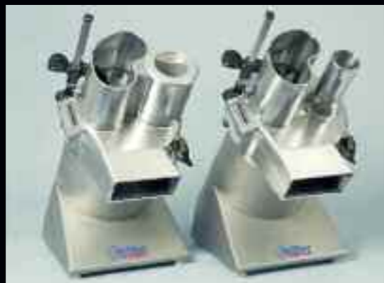
anliker Volume: The anliker5's big sister for large kitchens, canteens and municipal caterers.