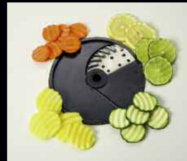
Wave cut (SU)