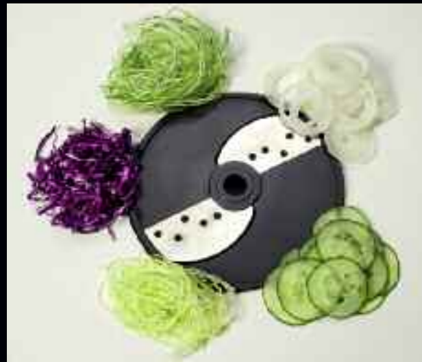
Fine cut (F)