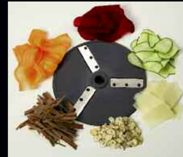
Shaving cut (HS)