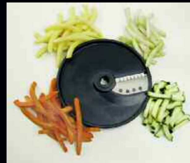
French fries (BT)